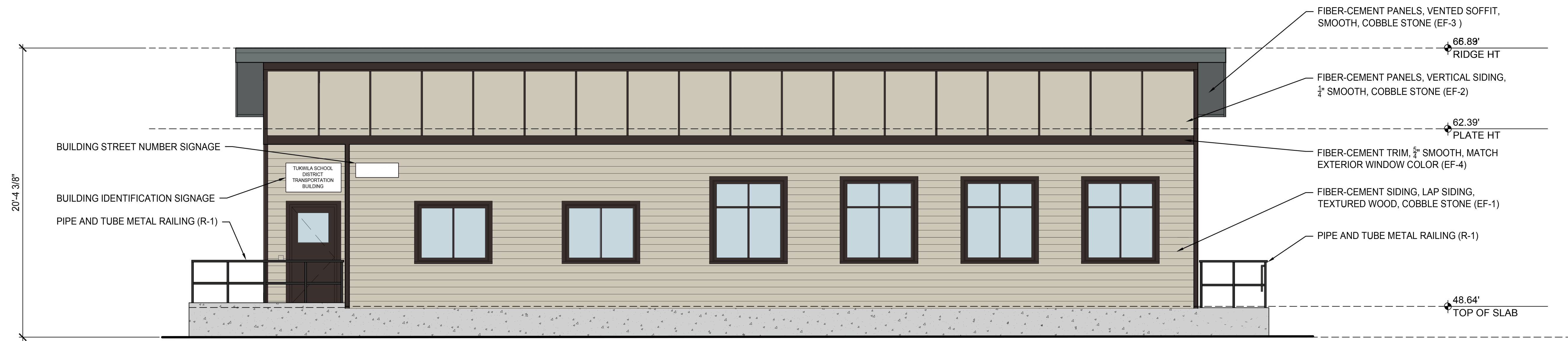
1 NORTH ELEVATION SCALE: 1/4" = 1'-0" A3.01_TB_EXT ELEVATIONS