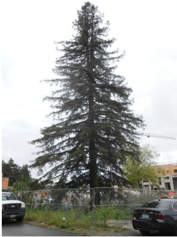
Above: The same tree 6/1/2017. The grade has been raised on all sides. Other trees were removed.