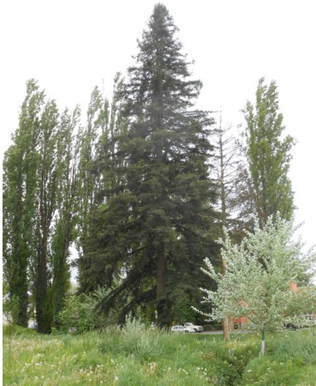
Above: The redwood on 4/28/2015 from the same angle.