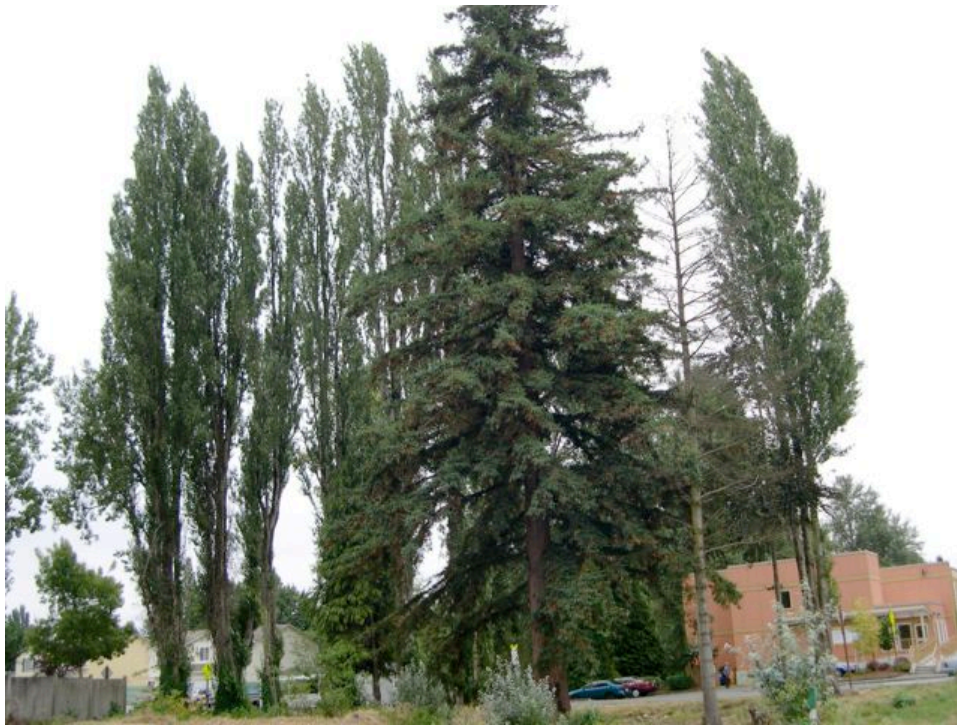
Above: Photo from 9/13/2011 shows #32 Coast redwood in a flat, wet grassy area. The photo was taken standing northwest of the tree.