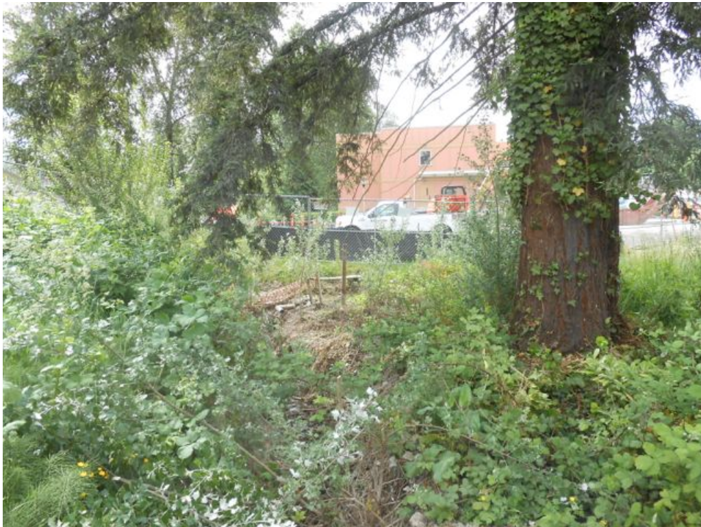
Above: 6/1/2017. The existing drainage swale can be seen to the left, east of the trunk. Note the orange protection fence adjacent to the swale. The portion of the swale to the north has already been filled.