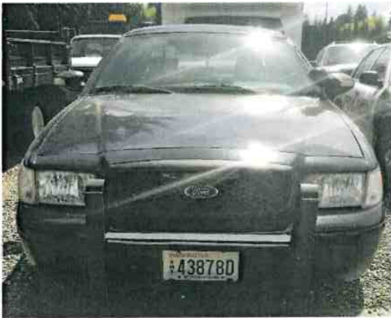
Unit 1715 2007 Ford Crown Victoria 89,000 mileage VIN: 2FAFP71W47X111105 Value: $1,507