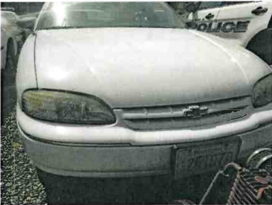
1101, 1999 Chevy Lumina 86,869 miles VIN: 2G1WL52K1W9277843 Value $1,200