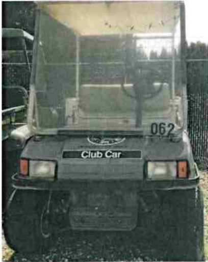
1062, 2005 Club Car Carry All dump bed S/N: PG0548-575021 Value $2,000