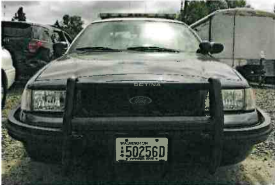
1730, 2010 Ford Crown Victoria, 94,156 miles VIN: 2FABP7BV6AX136700 Value $1,800