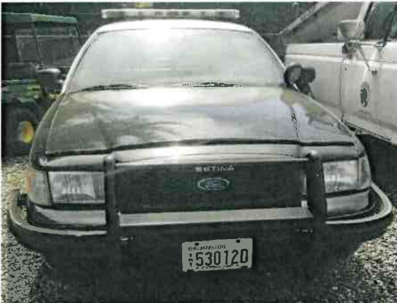
1738, 2011 Ford Crown Victoria 90,700 miles VIN: 2FABP7BV8BX177198 Value $1,800