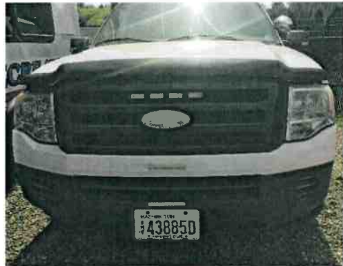
5569, 2007 Ford Expedition XLT 144,631 miles VIN: 1FMFU16567LA84191 Value $1,800