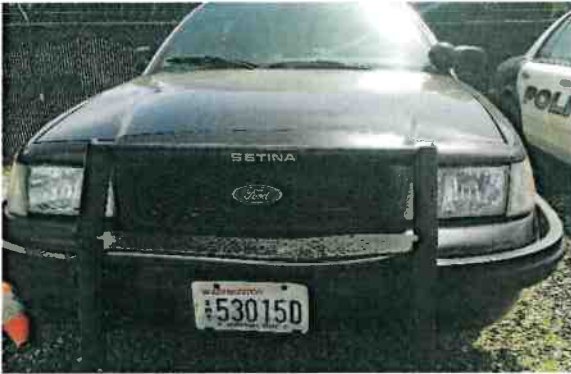
1737, 2011 Ford Crown Victoria VIN: 2FABP7BV6BX177197 Value $1,800