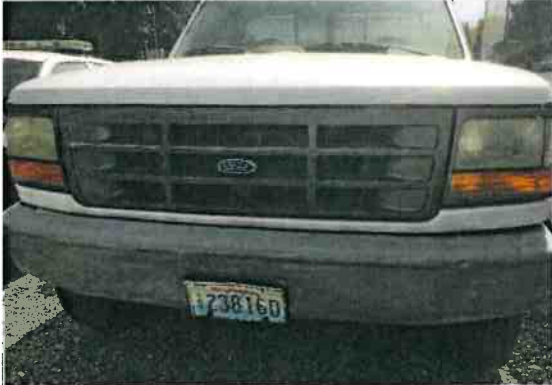
1215, 1996 Ford F250 dump 100,809 miles VIN: 2FTHF25G1TCA48655 Value $2,800