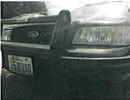
1735, 2011 Ford Crown Victoria VIN: 2FABP7BV2BX177195 Value $1,800