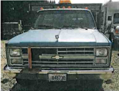
1213, 1988 Chevy 3/4 ton Pickp dump 10,896 miles VIN: 1GBGR34J7JJ132634 Value $3,000