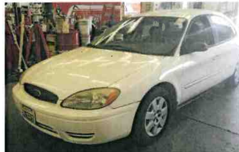
1158, 2005 Ford Taurus 75,836 miles VIN: 1FAFP53215A12063 Value $2,200