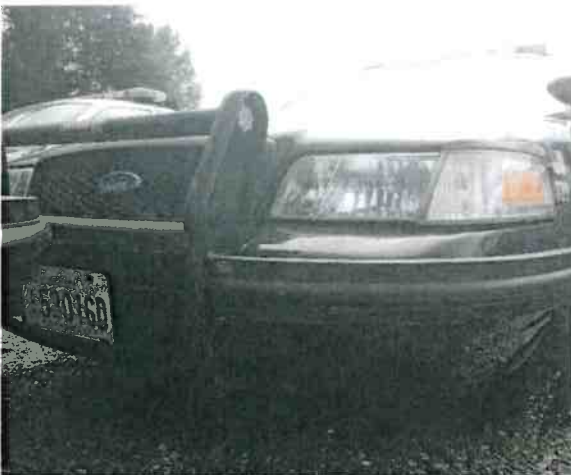
1739, 2011 Ford Crown Victoria 100,262 miles VIN: 2FABP7BVX177199 Value $1,800