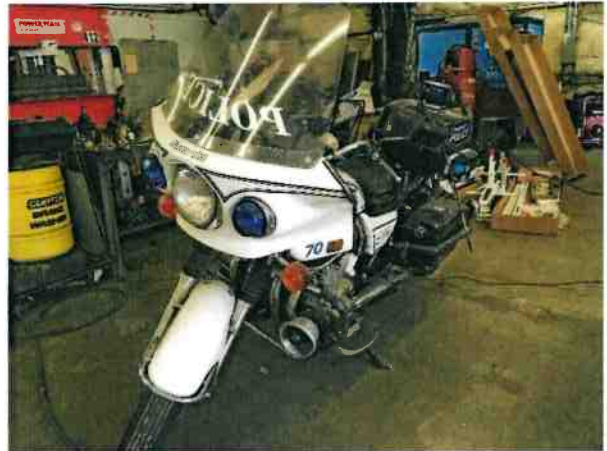
1070, 1995 Kawasaki KZ1000P14 with spare parts 37,030 miles VIN: JKAKZCP20SB513368 Value $1,200