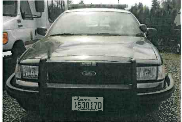
1740, 2011 Ford Crown Victoria 98,971 miles VIN: 2FABP7BV2BX177200 Value $1,800