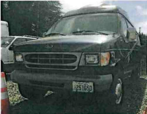
1202, 1998 Ford Club Wagon 30,183 miles VIN: 1FBSS31L4WHB36918 Value $2,700