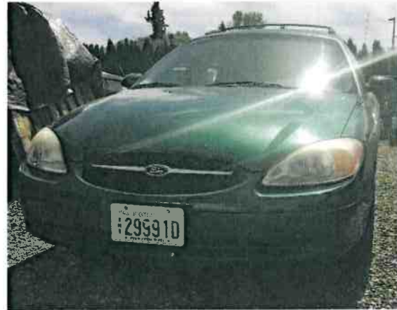
1133, 2000 Ford Taurus Wagon 56,591 miles VIN: 1FAFP5820YG167704 Value $2,000