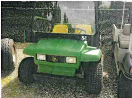
1064, 1999 John Deere Turf Gator S/N: W00TURF006706 Value $2,000