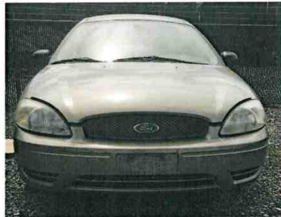
1151, 2005 Ford Taurus 129,340 miles, needs transmission VIN: 1FAFP53195A120631 Value $800