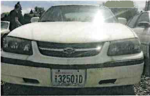
1166, 2001 Chevy Impala 102,921 miles, transmission input shaft seal leak VIN: 2G1WF55K219289981 Value $1,000