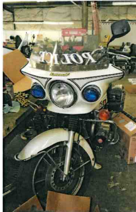
1075, 1989 Kawasaki KZ1000-P8, with spare parts 57,715 miles VIN: JKAKZCP23KB506477 Value $1,200