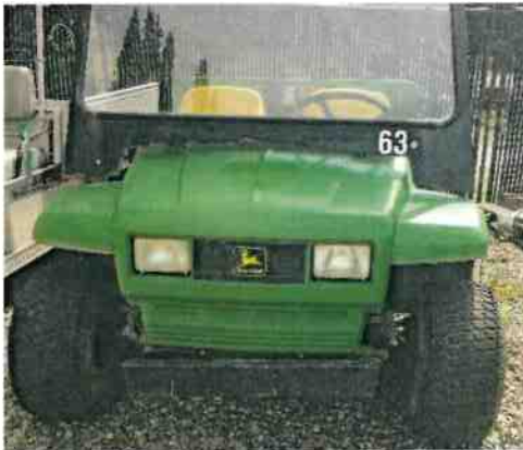
1063, 1999 John Deere Turf Gator S/N: W00TURF006659 Value $2,000