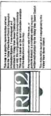
Exhibit A Valley View Sewer District