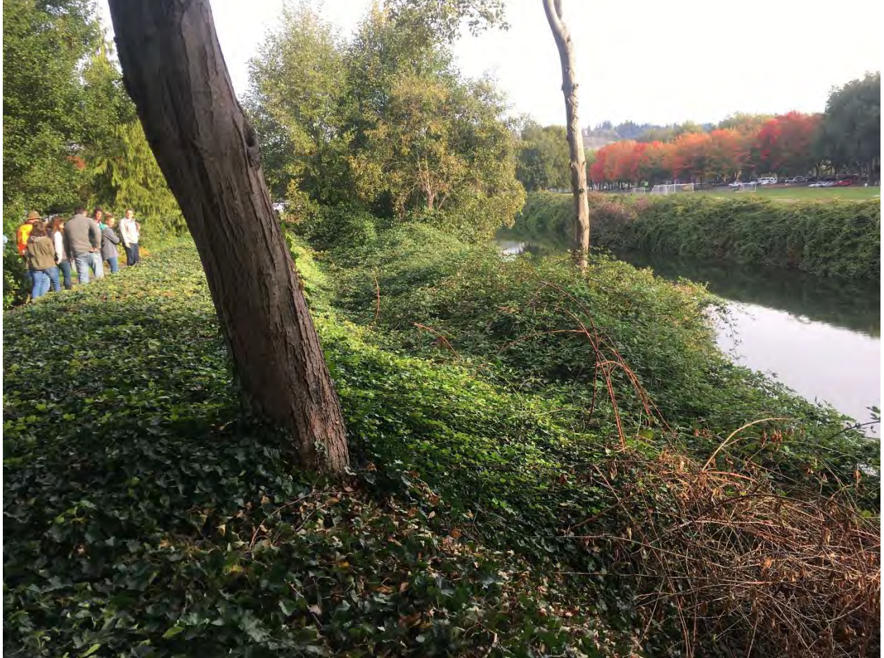
Figure 2: JSH Properties site, left bank, looking north/downriver; Starfire Sports Complex across the river