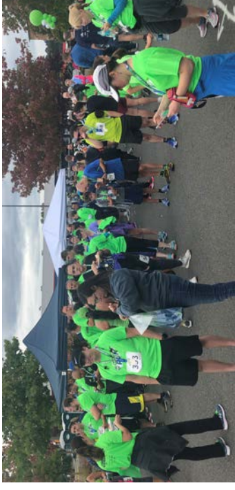
Rave Green Run in Tukwila