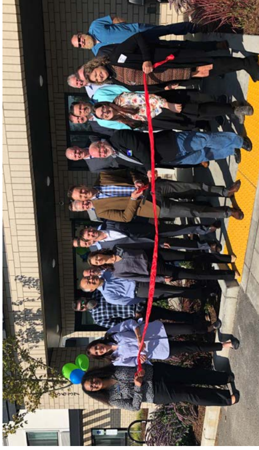
2018 Woodspring Suites Grand Opening