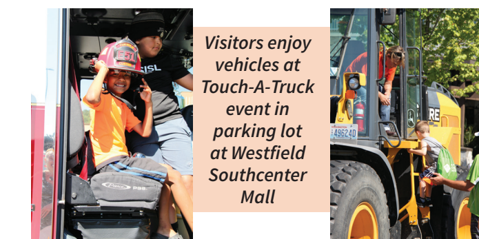
Visitors enjoy vehicles at Touch-A-Truck event in parking lot at Westfield Southcenter Mall