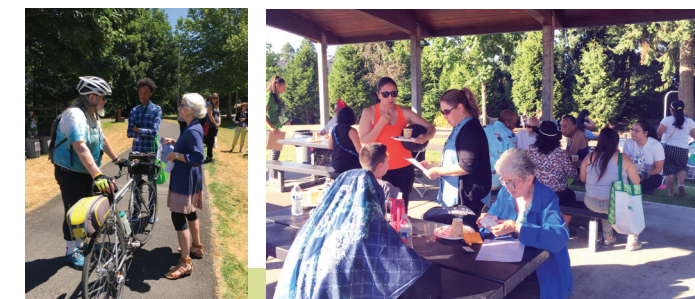
Scenes from recent "See You in the Park" events, hosted by Tukwila's Parks and Recreation Department

Tukwila City offices will be closed on Monday, September 4, in observance of Labor Day.