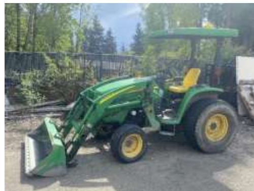
Unit 6302, 2008 John Deere Tractor/Loader 4120, S/N: LV4120H510306. 3,138 hours. Estimated value: $8,000