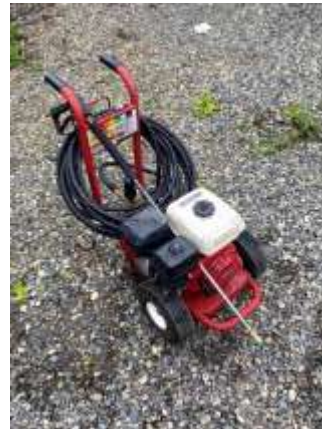
Unit 955FD, Pressure Washer. Estimated value: $50