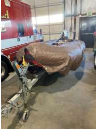
Unit 1015, 2003 Carnai Trailer, VIN: 5FMBT2J1231303218, License: 37698D. Estimated value: $500