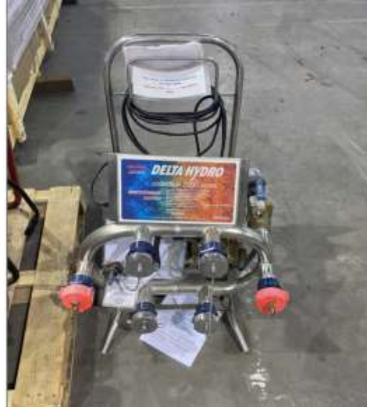
Unit 955FD, Tyco/Niedner Hose Tester Model HT-2000-SS, S/N: HT-0202192. Estimated value: $0