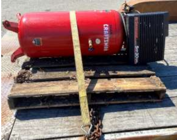
Unit 910ER, Craftsman Air Compressor. Estimated value: $50