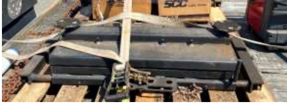
Unit 910ER, Axle Jack (qty 2). Estimated value: $200