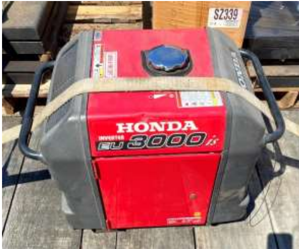
Unit 955FD, Honda EU3000IS Generator. Estimated value: $200