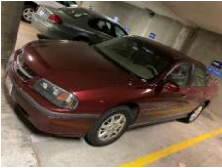
Unit 1188, 2001 Chevy Impala, VIN: 2G1WF55K819319520, License: 32509D. Estimated value: $2,500