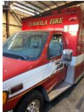
Unit 1314, 1998 Ford Road Rescue Aid Car, VIN: 1FDXE40F6WHB88993, License: 25187D. Estimated value: $9,500