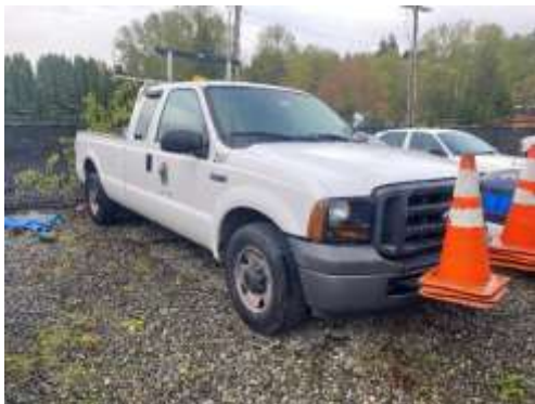
Unit 2201, 2007 Ford F250XL Crew Cab pickup, VIN: 1FTSX20597EA03424, License: 43838D. Mechanical issues. Estimated value: $3,000