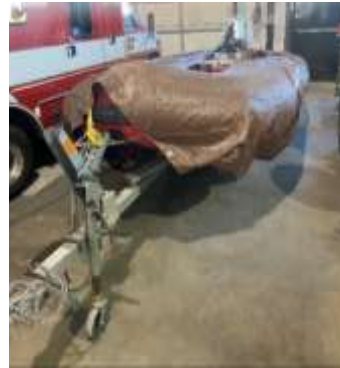
Unit 5015, 2009 Inflatable Rescue Boat Alaska Series Ranger 420 Alum Floor, HIN: AS17J005D808, License: WN25112. Estimated value: $900