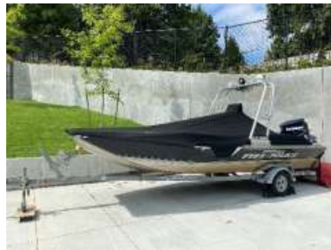
Unit 5020, 2010 Woolridge 20' Alaskan XL w/ 150 HP Evinrude Boat, HIN: WLG20247B010, License: WN26196. Insurance total. Estimated value: $1,000