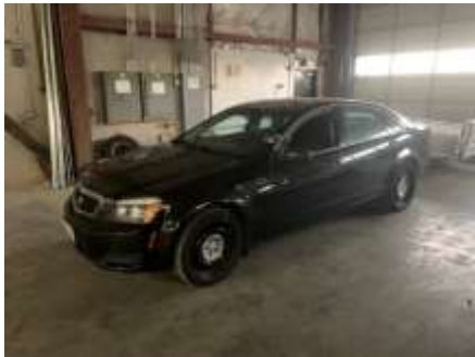
Unit 1433, 2012 Chevy Caprice, VIN: 6G1MK5U26CL660224, License: 54226D. Mechanical issues. Estimated value: $4,500