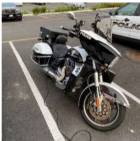
Unit 1085, 2014 Victory Commander I Motorcycle, VIN: 5VPDW36NXE3037357, License: 2685EX. Estimated value: $3,500