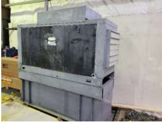
Unit 1852, 1996 Kohler 80KW Generator (old Lift Sta. 2 generator), S/N: 18684. Estimated value: $3,500