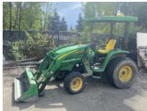
Unit 6302, 2008 John Deere Tractor/Loader 4120, S/N: LV4120H510306. 3,138 hours. Estimated value: $8,000