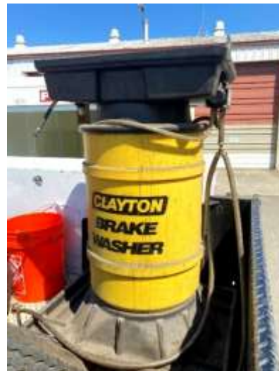
Unit 910ER, Solvent parts cleaner (Clayton). Estimated value: $50