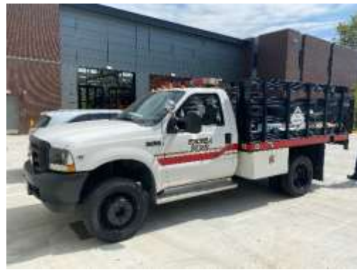
Unit 1234, 2003 Ford Superduty F550XL Flatbed, VIN: 1FDAF56S53ED86264, License: 37693D. Estimated value: $5,000