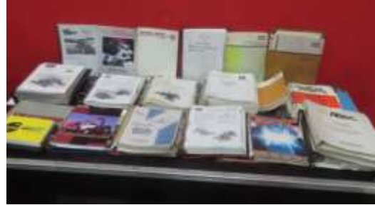
Unit 910ER, Old shop manuals for surplused vehicles no longer usable by Fleet. Estimated value: $50