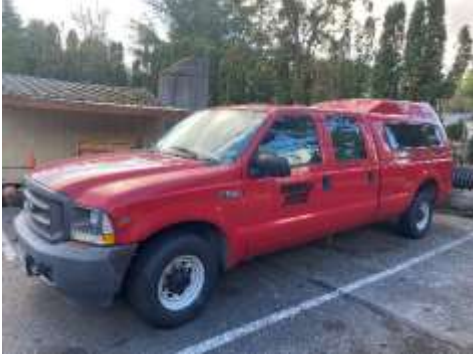
Unit 1239, 2002 Ford F250 Crewcab Pickup, VIN: 1FTNW20LX2EC28698, License: 34248D. Estimated value: $6,500