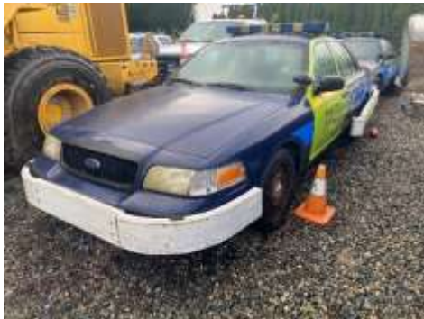
Unit 1720, 2008 Crown Victoria AFV, VIN: 2FAFP71VX8X100246, License: 45154D. Outfitted for PIT training in 2015. Estimated value: $1,500