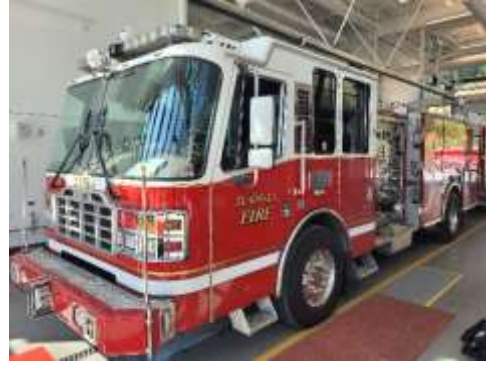
Unit 5519, 2006 Ferrara Inferno Pumper, VIN: 1F94544286H140395 BUILD H-3313, License: 43881D. Estimated value: $20,000