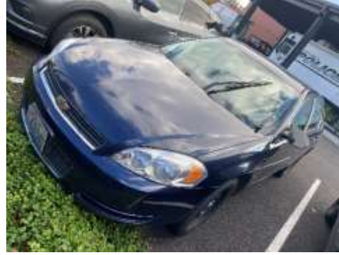
Unit 1727, 2008 Chevy Impala, VIN: 2G1WS583881354891, License: 47794D. Estimated value: $1,500