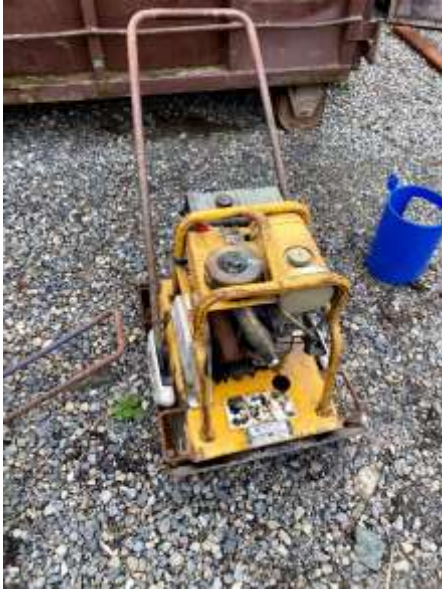
Unit 582, Wacker City ID: 1030009. Estimated value: $20