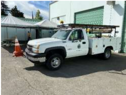
Unit 2200, 2007 1-ton Service Truck, Chevy Silverado 3500 Cab/Chassis, VIN: 1GBJC34U57E116693. License: 43844D. Estimated value: $4,500