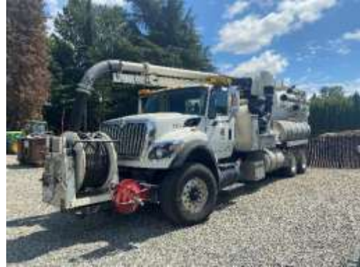
Unit 2311, 2009 International 7600 Cab/Chassis Vactor, VIN: 1HTWXAHT99J117600, License: 49212D. Traded in for new Vactor 2320. Value: $50,000