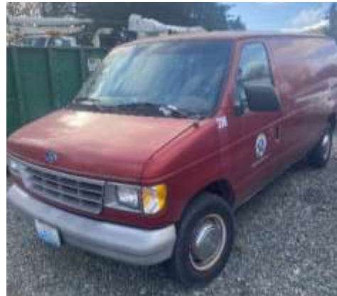
Unit 1236, 1996 Ford Econoline E150, VIN: 1FTFE24H0THA95432, License: 20645D. Mechanical issues. Estimated value: $1,500