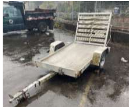
Unit 6004, 2009 Aluma 186 Utility 4x6 Trailer w/ Ramp, VIN: 1YGUS06139B057260, License: 49621D. Estimated value: $500