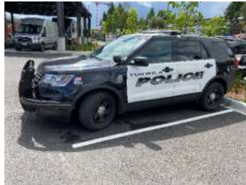
Unit 1751, 2016 Ford Interceptor Utility SUV AWD, VIN: 1FM5K8AR1GGA29032, License: 60011D. Mechanical issues. Estimated value: $1,500