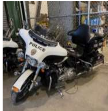
Unit 1088, 2017 Harley Davidson FLHTP Motorcycle, VIN: 1HD1FMC18HB683868, License: 2938EX. Estimated value: $5,000