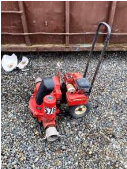
Unit 910ER, Homelite Textron Trash Pump Model 111DP3-2A, S/N: H00220057. Estimated value: $20