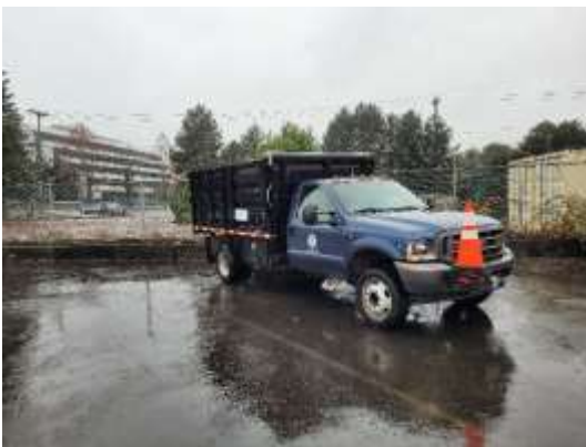
Unit 1229, Ford F450 Super Duty XL Dump Truck, VIN: 1FDXF46S14ED93606, License: 38269D. Estimated value: $5,000