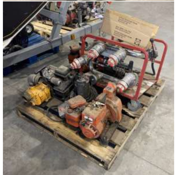
Unit 955FD: Miscellaneous pumps in poor condition.