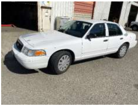
Unit 5401, 2007 Ford Crown Victoria, VIN: 2FAHP71W97X111125, License: 43846D. Estimated value: $1,000