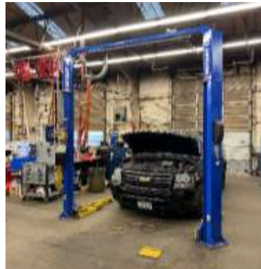
Unit 1810, 1992 Western 4-Post Lift, S/N: 72-245 MODEL WRTA 25-4. Estimated value: $0