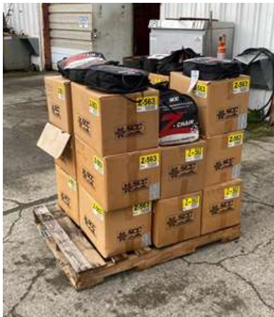
Unit 910ER, Various tire chains for old fleet (Crown Victoria) that no longer fit any fleet vehicle. Estimated value: $200

THE FOLLOWING ITEMS ARE A RESULT OF MOVING FROM THE GEORGE LONG FLEET/FACILITIES SHOP AND FIRE'S MOVE INTO NEW FIRE STATIONS. ITEMS ARE OBSOLETE, HAVE BEEN REPLACED OR ARE IN POOR OPERATING CONDITION.