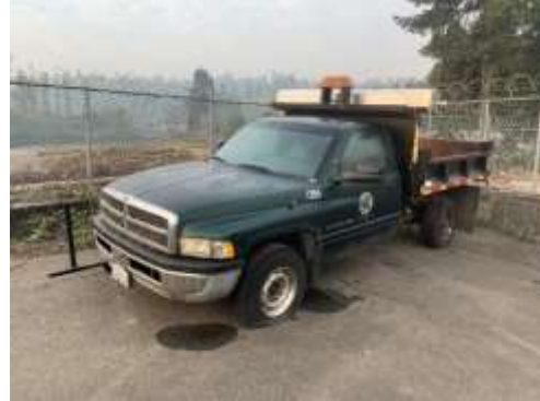
Unit 1294, 2001 3/4-ton Dodge Ram Clubcab, VIN: 3B6KC26Z61M258351, License: 29917D. Mechanical issues. Estimated value: $3,500