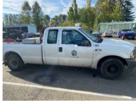
Unit 1261, 2004 Ford F250. VIN: 1FTNX20L24ED66624, License: 37708D, miles. Estimated value: $3,500