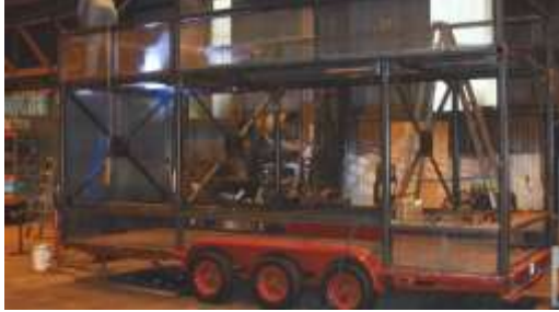
Unit 1010, 1984 Strong Boy Tri-axle Trailer, VIN: 1L95D382XESD18652, License: 12561D. Estimated value: $1,500