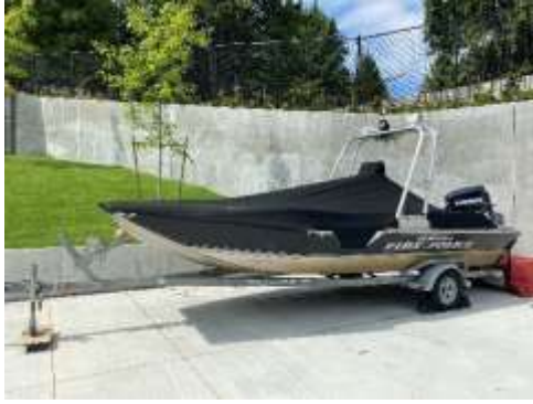
Unit 5021, 2009 EZ Loader Boat Trailer, VIN: 1ZEAAARC59A168760, License: 24354D. Estimated value: $500