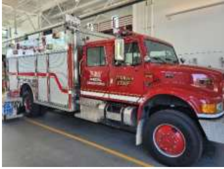
Unit 1353, 1996 International Rescue Truck, VIN: 1HTSEAN0TH360923, License: 23830D. Estimated value: $40,000