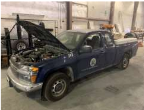
Unit 1243, 2004 Chevrolet Colorado Pickup, VIN: 1GCCS196948198086, License: 38267D. Estimated value: $1,500