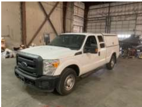
Unit 5404, 2012 Ford F250 XL w/ canopy, VIN: 1FT7X2A64CEC13694, License: 54224D. Mechanical issues. Estimated value: $2,500