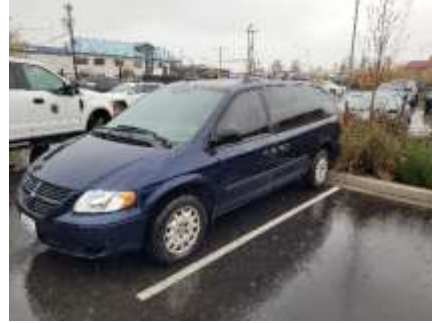
Unit 1232, Dodge Grand Caravan CV, VIN: 1D4GP23R55B174631, License: 38266D. Estimated value: $1,500