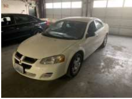
Unit 7101, 2006 Dodge Stratus FFV, VIN: 1B3AL46T36N280580, License: 43836D. Mechanical issues. Estimated value: $3,000