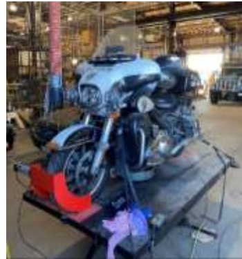
Unit 1087, 2017 Harley Davidson FLHTP Motorcycle, VIN: 1HD1FMC16HB683447, License: 2937EX. Estimated value: $5,000