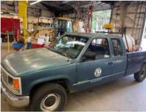
Unit 1242, 1991 GMC Pickup, VIN: 2GTGC29J0M1538107, License: 10877D. Estimated value: $1,000