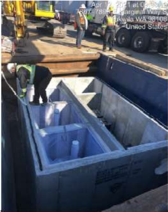
Stormwater media filter unit installation