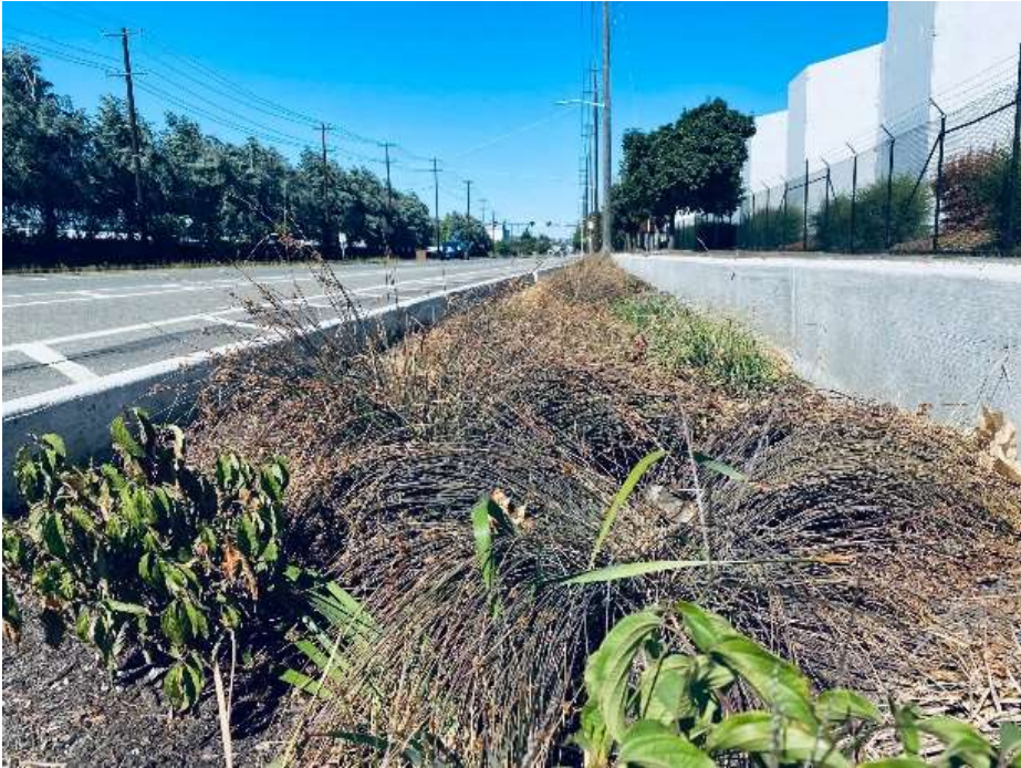
Bioretention planter, late summer 2022