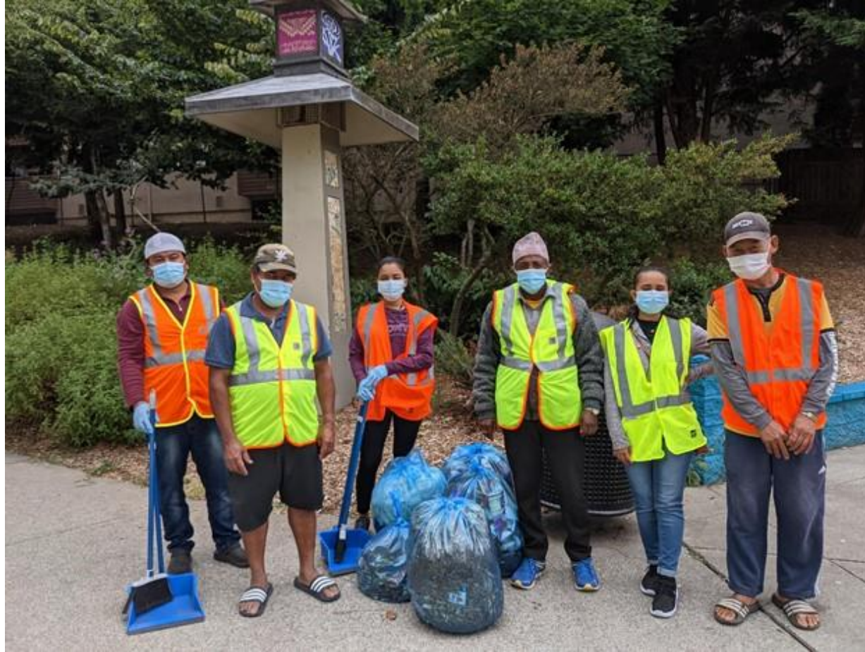
Bhutanese Community Resource Center Park Clean Up at Cascade View Park