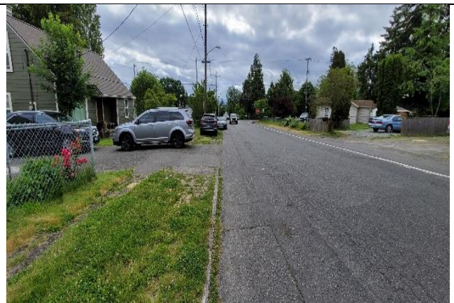
S 140 th