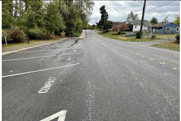
Macadam Winter Garden Parking