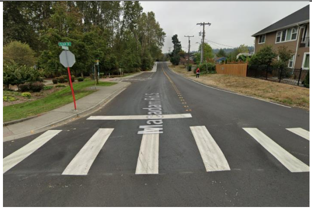
144 th St & Macadam Rd S