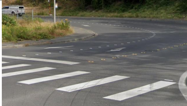
Southcenter Blvd & Macadam Rd S