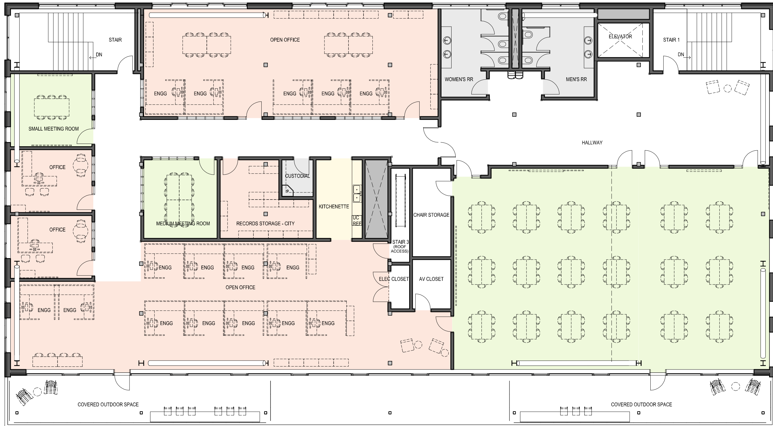
M&E Building - Floor Plan - Level 3