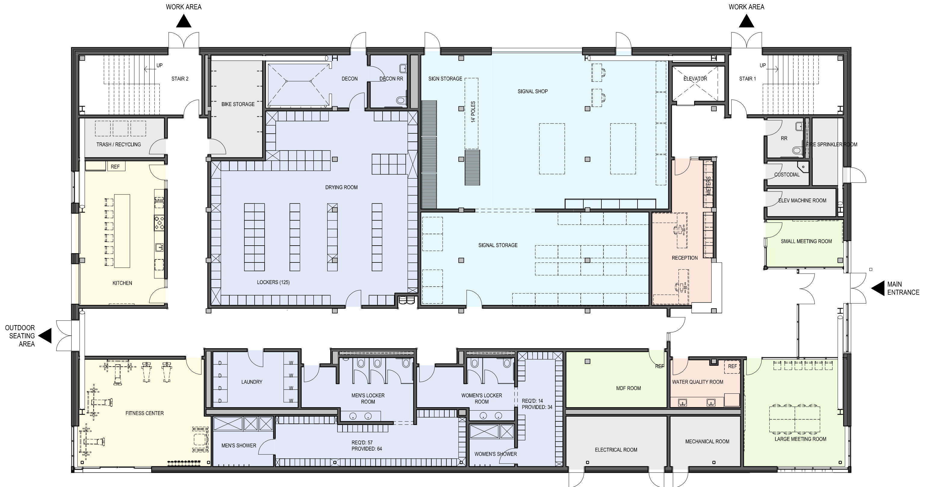
M&E Building - Floor Plan - Level 1

Tukwila Maintenance & Engineering East Campus Project SCHEMATIC DESIGN DRAFT 10/31/23