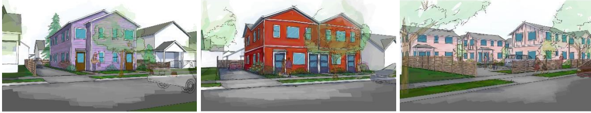
Figure 2. Middle housing illustrations.