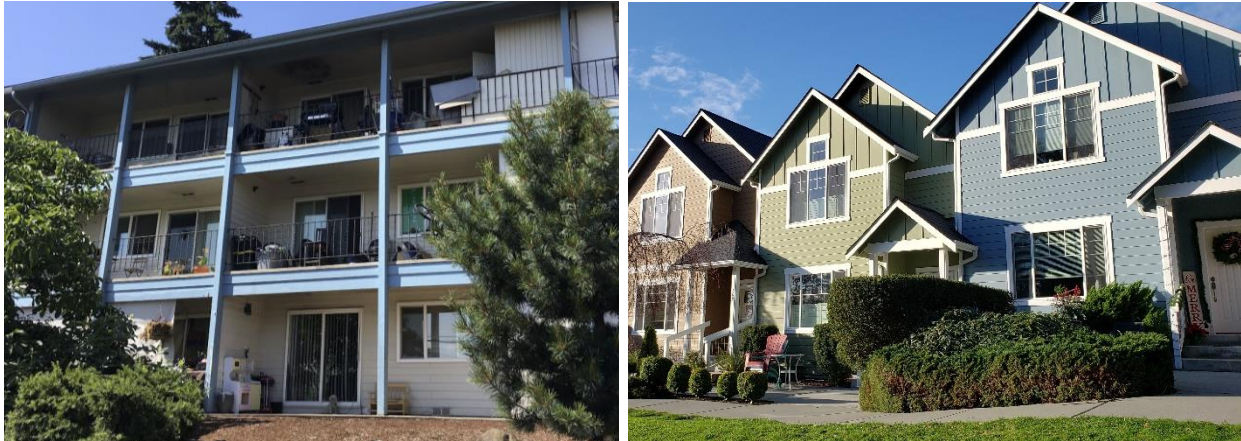
Figure 1. Housing of different designs, ownership arrangements, and prices help meet the diverse needs of Tukwila residents.