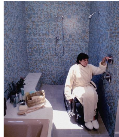
Figure 4. Bathroom with universal design principles.

As the population changes over time, family structures gradually transform as well. Many homes are designed around the concept of the nuclear family, typically two adults tied by partnership or marriage, with their minor children. This arrangement once represented a majority of households. Today there is a wider variety of households than in the mid-twentieth century; for example, adults living without children, single adults, and multigenerational families. Universal design helps to support aging in place and multigenerational families by applying design principles that emphasize flexibility, intuitive design, and variations in size and space for different users ( Center for Excellence in Universal Design ). One example is a home that includes wide hallways and doorways to ease wheelchair user navigation, tiered or height-adjustable countertops to accommodate more than one height, and a bathroom shower that is spacious and flush with the floor. Through home modifications or retrofitting, barriers that limit a home's accessibility can be eliminated, and families can be better prepared for a lifetime of changing needs.