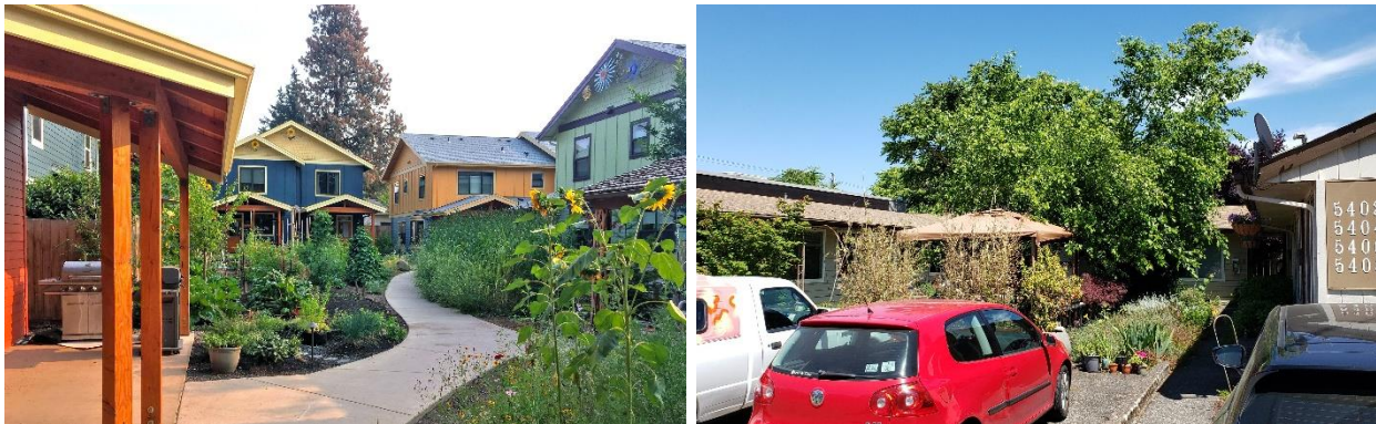
Figure 3. Examples of housing with a common open space to strengthen relationships between neighbors and create safe outdoor play areas for children.

Family-sized, family-friendly housing units contain at least two bedrooms and include features such as areas where family members can gather for meals and other activities, sufficient storage space, a spot for children to do homework, and easy access to outdoor play and recreation space. Due to various factors related to building design, market demand, and building code stipulations, apartment buildings are rarely constructed with family-sized units with more than two bedrooms and associated spaces. While these elements are historically available in single family detached homes, middle housing types of development, such as duplexes and townhomes, can be well-suited to providing more spacious family-sized housing. Encouraging new family-sized housing in areas with access to transit and proximity to schools, parks, low-traffic streets, and other family-friendly elements will make it easier for families to find their home in Tukwila.