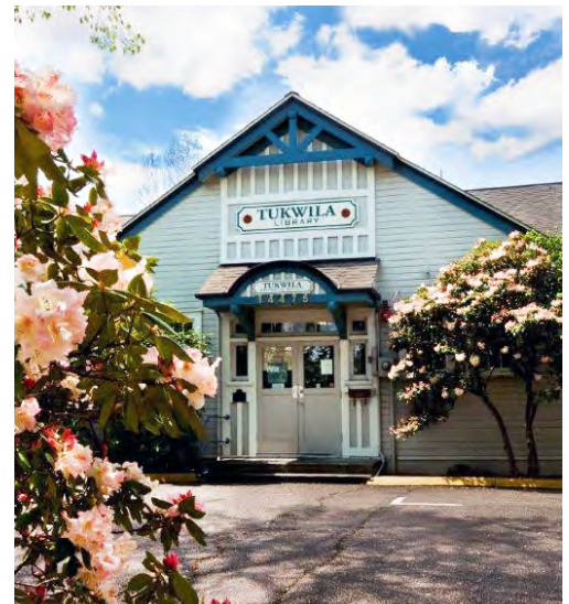
Original Tukwila City Hall Building

Due to Tukwila's location on the Green/Duwamish River, the area has been home to many Native American settlements, and played an important role in local Native American history and culture. Development along certain portions of the river has exposed artifacts from the days when Native Americans travelled the river and camped along its banks. These artifacts require protection from future development, and improved interpretation so that the public can appreciate their origin and significance.