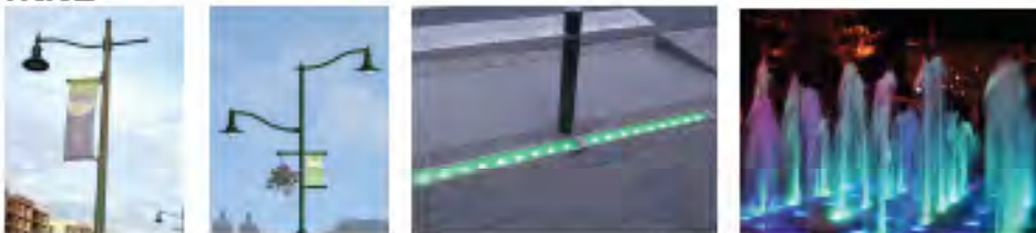
High-Quality Design Features