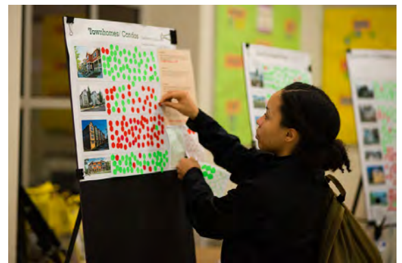
Community Preference Survey – March 2013