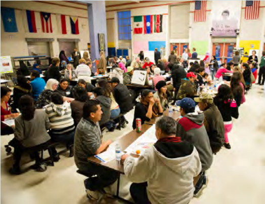
Community Conversations – March 2013

The City hosted Community Conversations to identify issues as part of the update to the Comprehensive Plan, and Community Conversation outreach meetings when developing the 2012 Strategic Plan. As part of these efforts, community members consistently expressed their desire for better access to recreational opportunities, safer routes to schools for children, and better access to affordable, good quality food, including fresh fruits and vegetables. The community-expressed need for better access to food is supported by the U.S. Department of Agriculture identification of Tukwila as a “food desert,” based on its definition that Tukwila’s low-income census tracts show a significant number of residents are located more than one mile from the nearest supermarket.