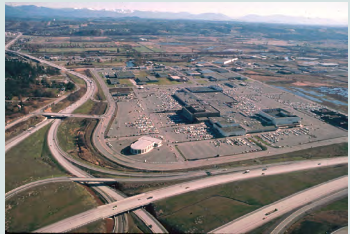
I-5 / I-405 Interchange – February 1973