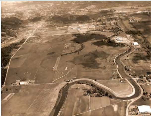
Tukwila, looking north from S 180th Street – May 1965