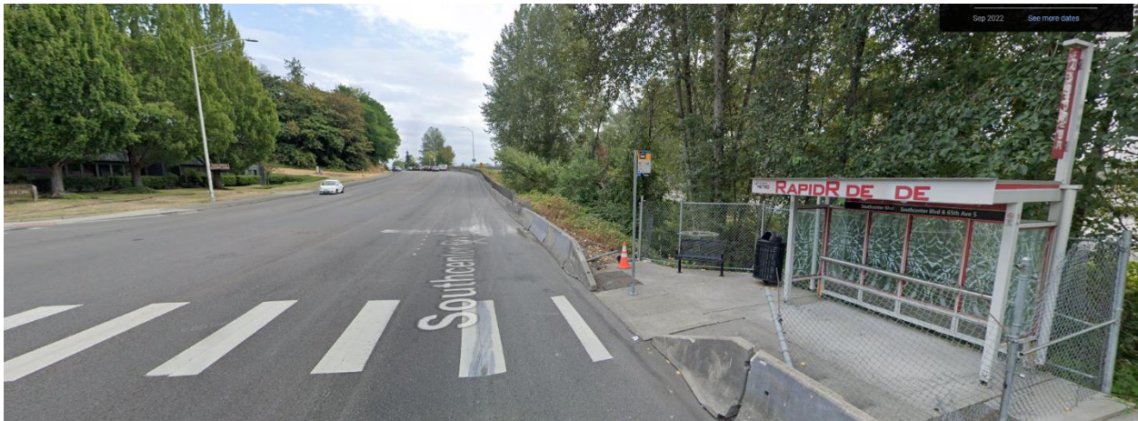
Southcenter Blvd/65 th Ave S Signal Facing East at the Bus Stop