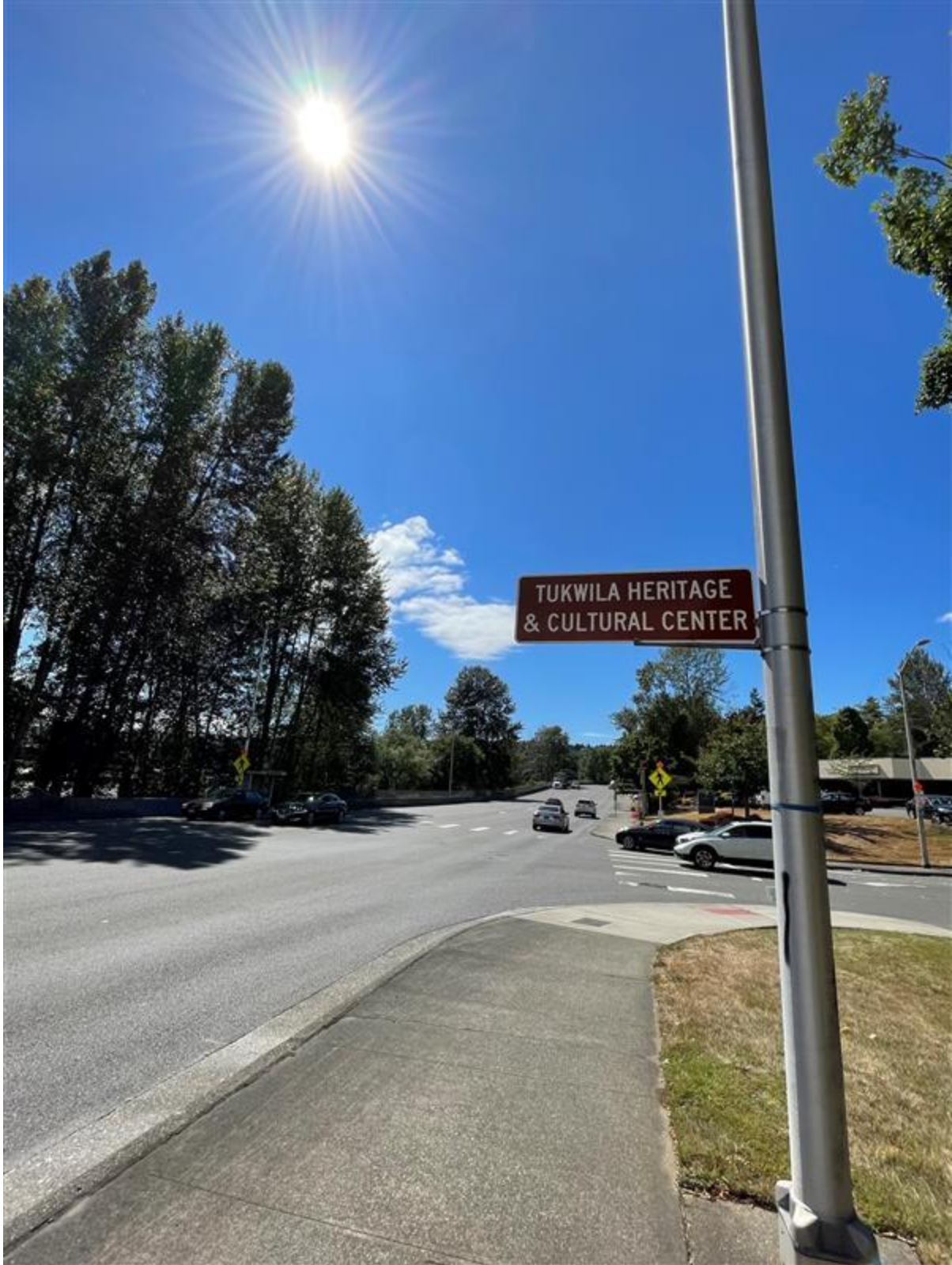
Southcenter Blvd/65 th Ave S Signal Facing West