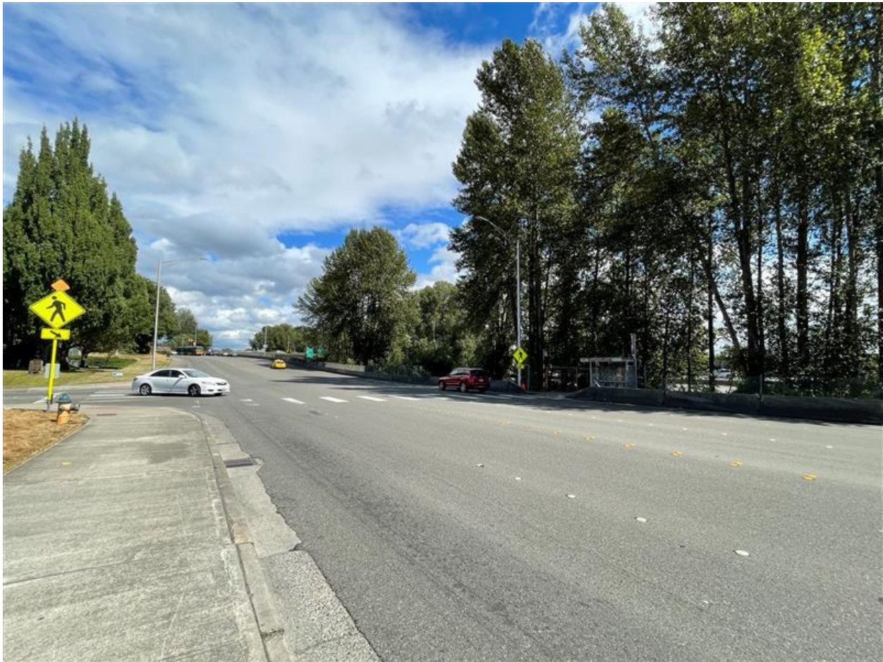
Southcenter Blvd/65 th Ave S Signal Facing East