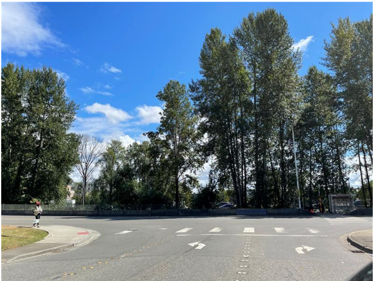
Southcenter Blvd/65th Ave S Signal Facing South