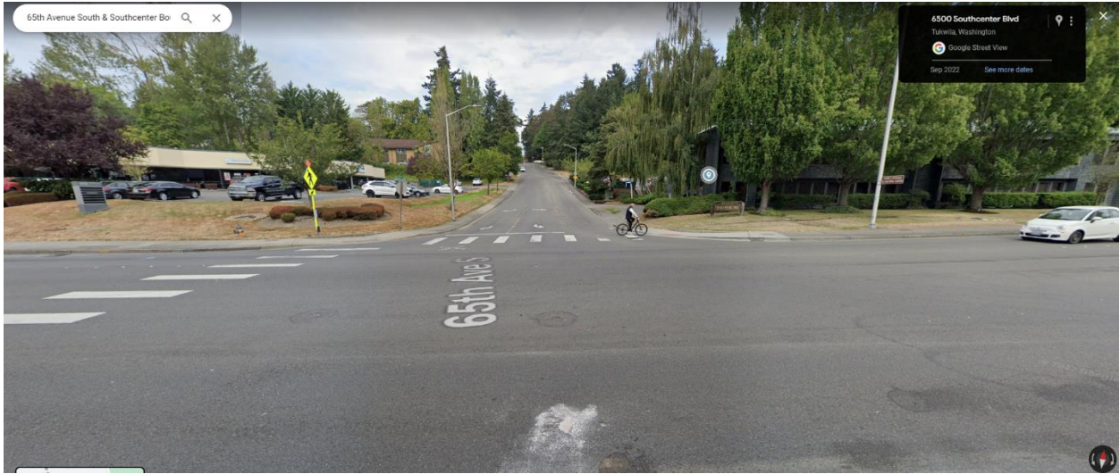
Southcenter Blvd/65th Ave S Signal Facing North