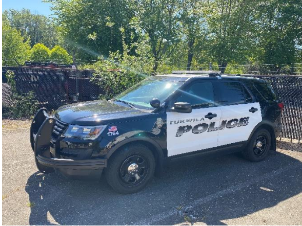
Unit 1764, 2017 FORD POLICE INTERCEPTOR UTILITY, License 62569D, VIN 1FM5K8AR6HGD93769. Estimated value: $,500