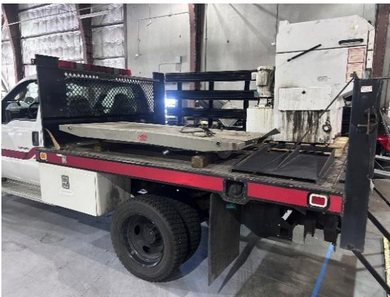
Unit 910ER, MOTORCYCLE LIFT, QTY 2. Estimated value: $500 EACH.