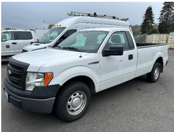
Unit 6201, 2013 FORD F150, License 72185D, VIN 1FTNF1CF1DKE99895. Estimated value: $ 3,500