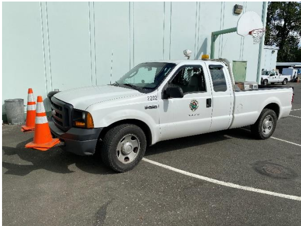
Unit 2202, 2007 FORD SD F350 SUPERCAB, License 43840D, VIN 1FTWX30537EA03426. Estimated value: $3,000