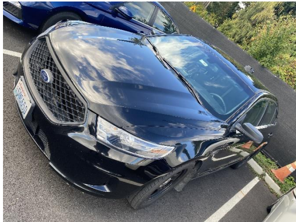
Unit 1750, 2015 FORD INTERCEPTOR, License 59665D, VIN 1FAHP2MK6FG184713. Estimated value: $3,000