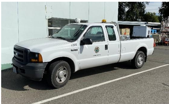
Unit 2204, 2007 FORD F250 SUPERCAB, License 43837D, VIN 1FTSX20507EA03425. Estimated value: $3,000