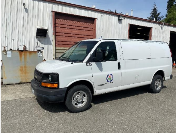
Unit 1275, 2003 CHEVY EXPRESS CARGO VAN, License 61421D, VIN 1GCGG25V331170247. Estimated Value: $3,000