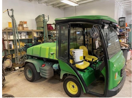
Unit 6612, 2011 PROGATOR 2010 WITH 200 GAL SPRAY TANK & 18' SPRAY BOOM, VIN 1TC203ATLBT050085, Estimated value: $10,000