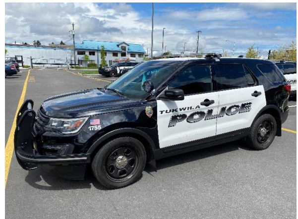
Unit 1755, 2017 FORD POLICE INTERCEPTOR UTILITY, License 61489D, VIN 1FM5K8AR8HGA94963. Estimated value: $3,500