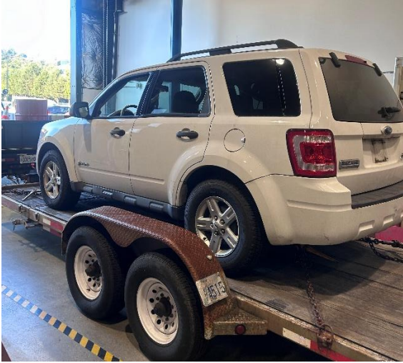
Unit 7202, 2009 FORD ESCAPE HYBRID, License 68866D, VIN 1FMCU49369KA89706. Estimated value: $1,500