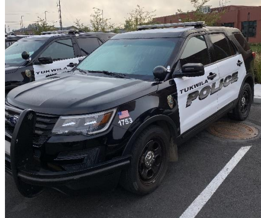
Unit 1753, 2016 FORD POLICE INTERCEPTOR UTILITY, License 59655D, VIN 1FM5K8AR3GGA290331. Estimated value: $3,500