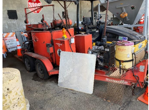
Unit 1412, 1992 CRAFTCO EX POUR 200 DIESEL MELTER, License 15861D, S/N:1C9ED1226N1418231. Estimated value: $ 1,300