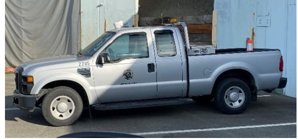
Unit 2205, 2008 FORD F250 EXT CAB, License 46806D, VIN 1FTNX20588EE03201. Estimated value: $5,000