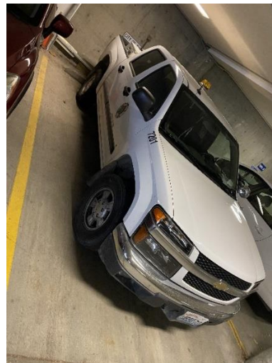
Unit 7201, 2008 CHEVROLET COLORADO CREW CAB, License 46807D, VIN 1GCCS33E888217129. Estimated Value: $2,000 – MECHANICAL ISSUES.