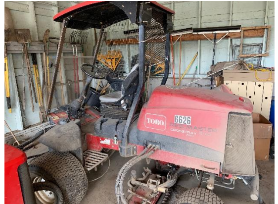
Unit 6626, 2017 TORO REELMASTER 5410-D CROSSTRAX 8 BLADE-REEL, S/N: 03670-280000335. Estimated value: $1.500