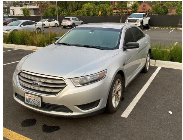
Unit 1436, 2015 FORD TAURUS, License AUSS5538, VIN 1FAHP2D86FG162277. Estimated Value: $2,000