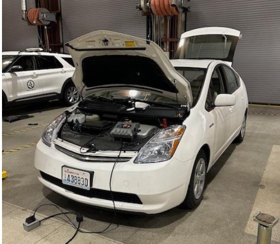
Unit 3101, 2007 TOYOTA PRIUS HYBRID, License 43883D, VIN JTDKB20UX77088395. Estimated value: $2,500