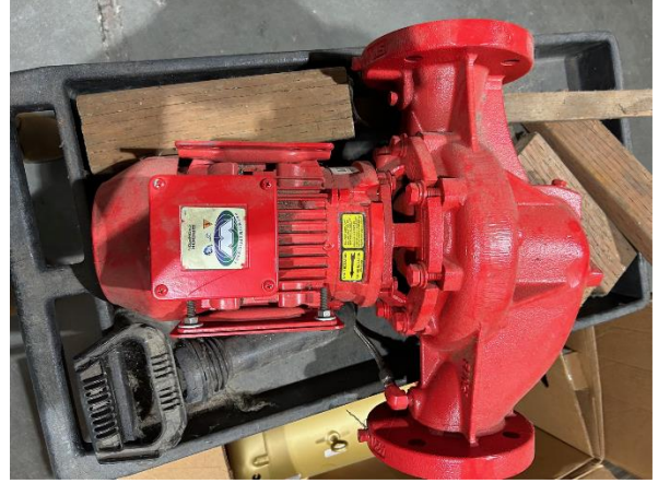
UNIT 920BM, ARMSTRONG HYDRONIC PUMP. Estimated Value $500