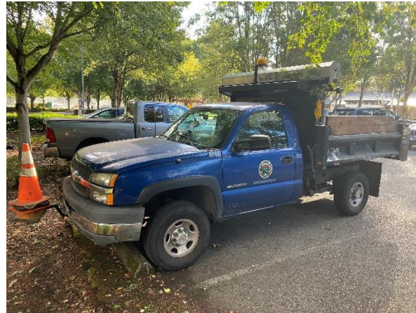
Unit 1246, 2004 CHEVY SILVERADO C2500, License 38265D, VIN 1GBHC24U24E361021. Estimated value: $4,500