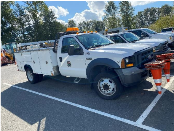
Unit 1291, 2006 FORD F450XL, License 33259D, VIN 1FDFX46Y06EA60997. Estimated value: $ 3,000