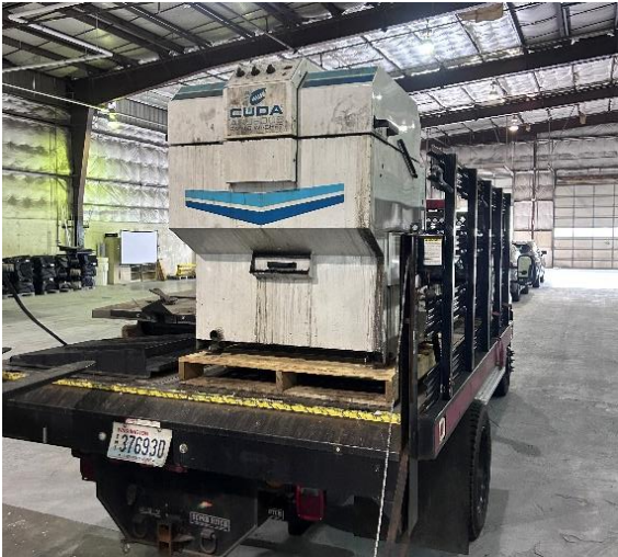
Unit 9602, 2006 PARTS WASHER, CUDA TOP-LOAD AQUEOUS, S/N: C0106-62074. Estimated value: $500