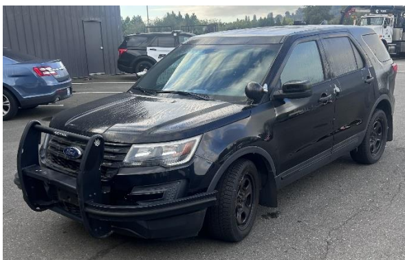
Unit 1752, 2016 FORD POLICE INTERCEPTOR UTILITY, License 60012D, VIN 1FM5K8ARXGGA29031. Estimated value: $3,500