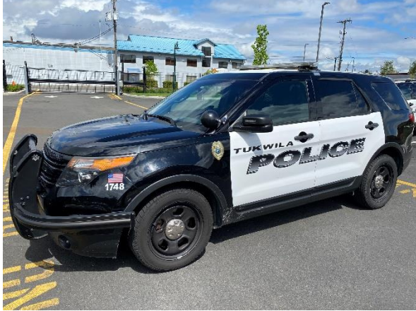
Unit 1748, 2015 FORD POLICE INTERCEPTOR UTILITY, License 56557D, VIN 1FM5K8ARXFGA16102. Estimated value: $3,500