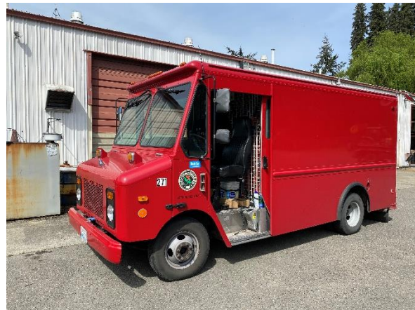
Unit 1271, 2003 GRUMMAN WORKHORSE 14' WALK-IN STEP VAN, License 37697D, VIN 5B4HP42R233370943. Estimated value: $6,500