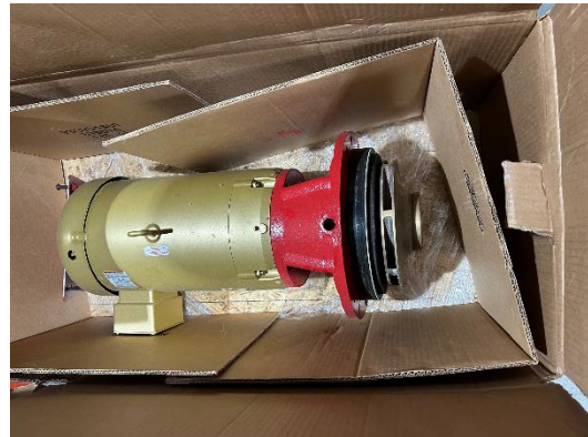
UNIT 920BM, BALDOR RELIANCE SUPER E MOTORY W/ PUMP. Estimated value $1,000