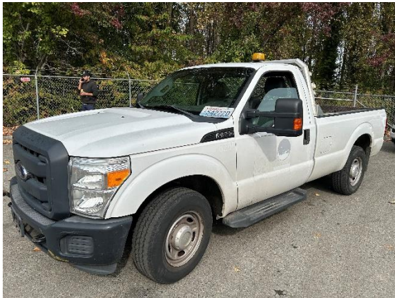
Unit 6200, 2012 FORD F250, License 54222D, VIN 1FTBF2A66CEC13662. Estimated value: $3,000