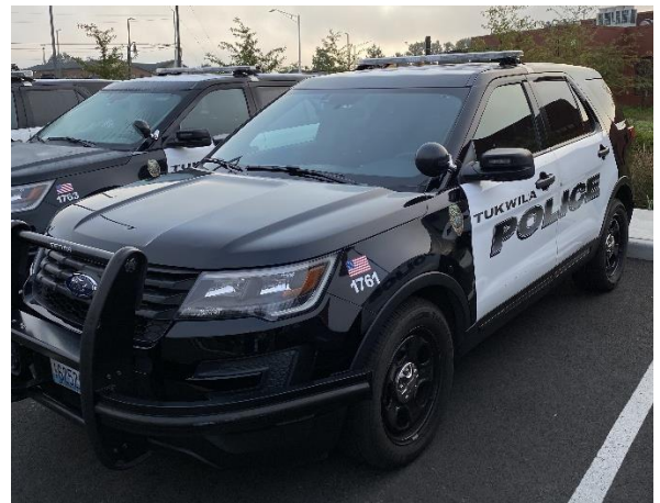
Unit 1761, 2017 FORD POLICE INTERCEPTOR UTILITY, License 62528D, VIN 1FM5K8AR2HGD93770. Estimated value: $3,500