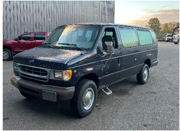
Unit 1233, 2000 FORD ECONO CLUBWAGON VAN, License 31110D, VIN 1FBSS31L0YHB72270. Estimated value: $3,500