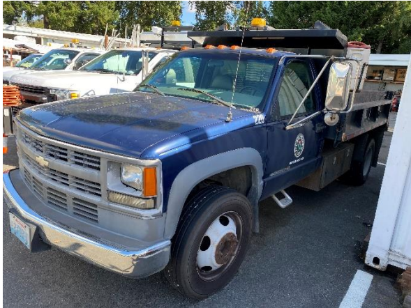
Unit 1220, 1999 CHEVY C30 1-TON DUMP, License 27089D, VIN 1GBKC34J6XF060736. Estimated value: $2,500