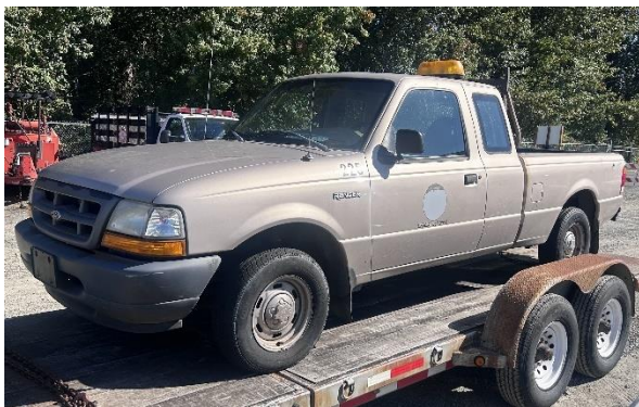
Unit 1225, 1998 FORD RANGER EXT CAB, License 25147D, VIN 1FTYR14UXWPA87465. Estimated value: $1,000