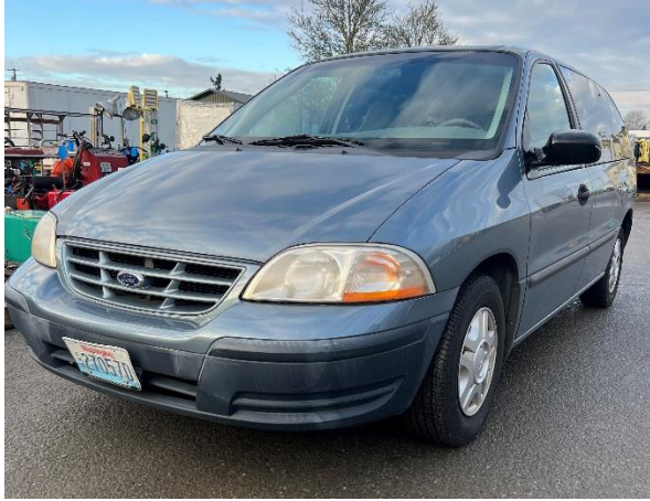
Unit 1219, 1999 FORD WINSTAR CARGO VAN, License 27057D, VIN 2FTZA5444XBB21296. Estimated value: $1,500