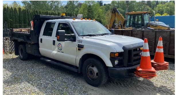
Unit 2312, 2008 1-TON DUMP FORD F350 SD CREW CAB, License 47790D, VIN 1FDWW36Y18EE22781. Estimated value: $4,000