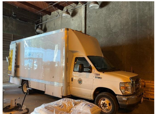
Unit 2900, 2013 CUES TV VAN FORD E450 CHASSIS, License 54288D, VIN 1FDXE4FS9DDA24887. Estimated value: $10,000