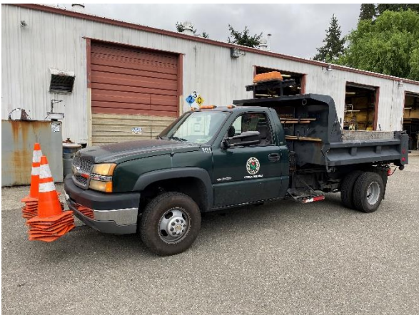
Unit 1301, 2004 CHEVY SILVERADO 3500, License 37707D, VIN 1GBJC34U94E352811. Estimated value: $ 4,000