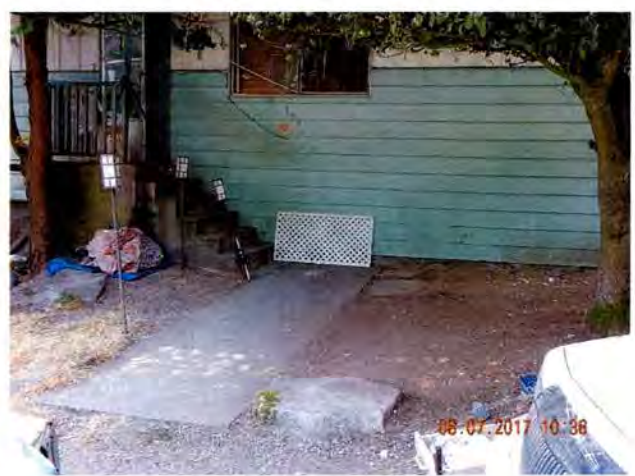
August 7, 2017 (after dumpster delivered)