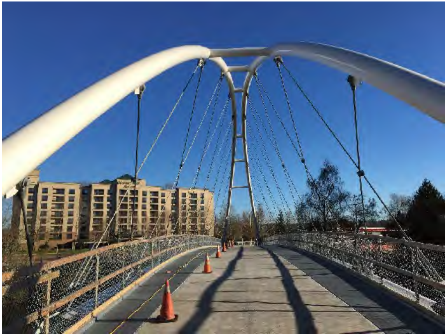
Tukwila Urban Center Pedestrian Bridge