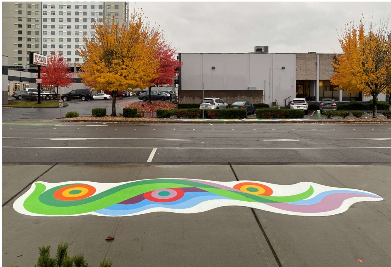
One of the final waves installed along Baker Blvd.

Last year the City of Tukwila Parks and Recreation Department installed artwork along Baker Blvd in the Southcenter District. This artwork was funded largely by the City's tourism funding, with additional funds coming from the City 1% for arts. The artwork is entitled, "Walking the Waves" and is a series of 13 wave designs and 52 dots. This artwork was focused along Baker Blvd between Andover Park West and East.