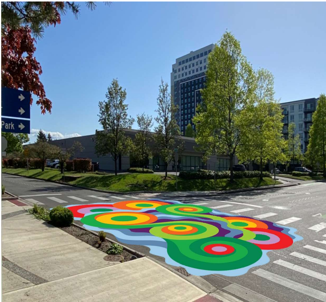
Representation of intersection art at Baker Blvd and Christensen Road.