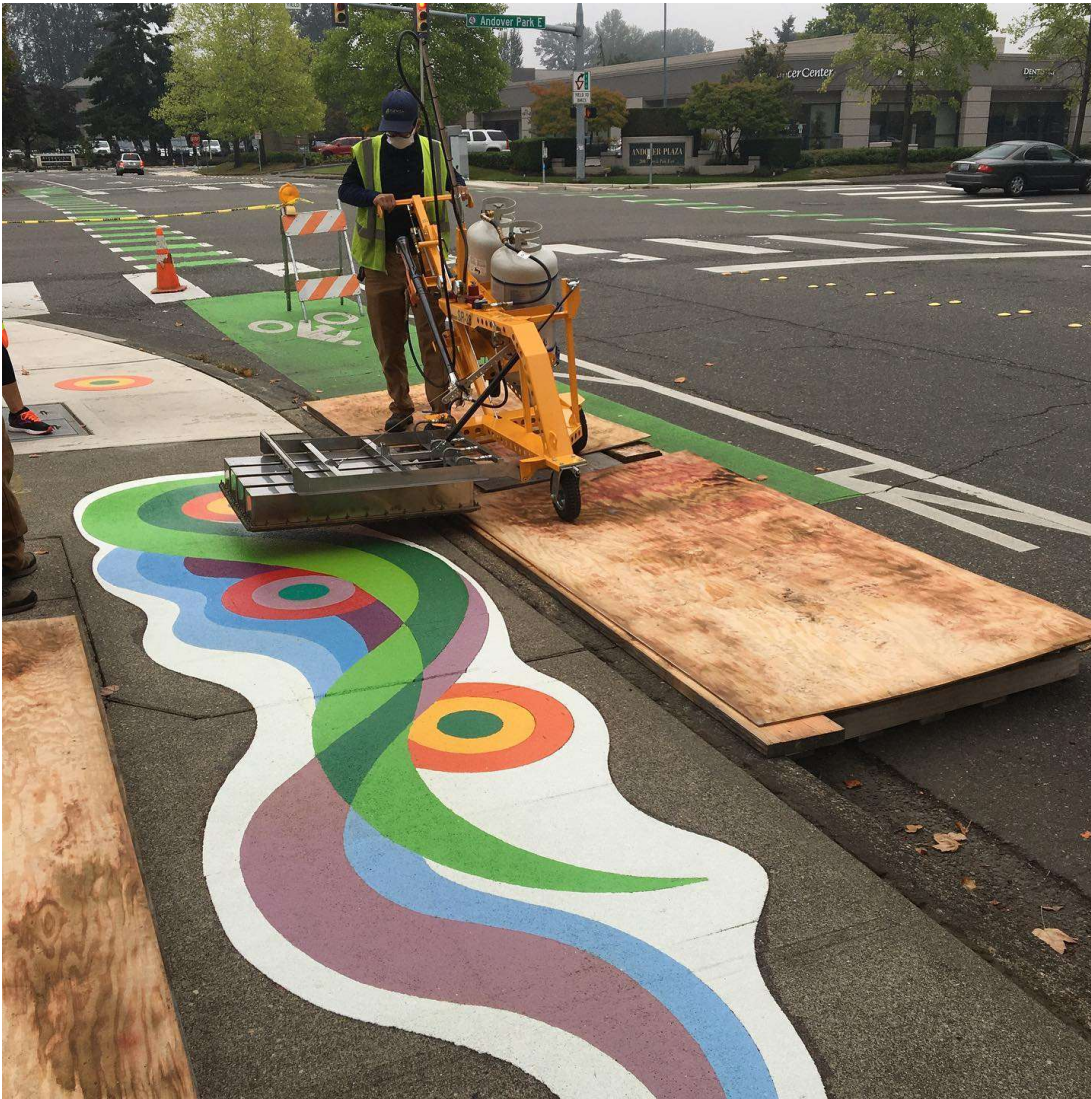
City staff installing one of the art pieces on a sidewalk along Baker Blvd.

Baker Blvd serves as the pedestrian spine for the City's Southcenter District, linking the Sound Transit Commuter Rail Station, via the pedestrian bridge, to the District's core. Additionally, Baker Blvd has been identified as a festival street in the District. The City has already used the street for two 5K runs with the Rave Foundation. The art helps to make a better environment for users of the Blvd and creates a sense of a destination for the District. Finally, the artwork is in the City's hotel district. There are approximately 2,000 hotel rooms located within one mile of Baker Blvd.