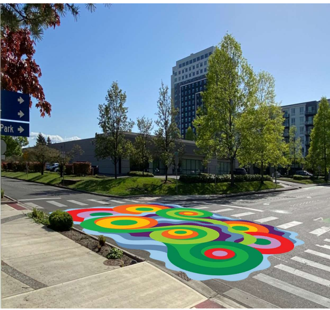
Representation of intersection art at Baker Blvd and Christensen Road.