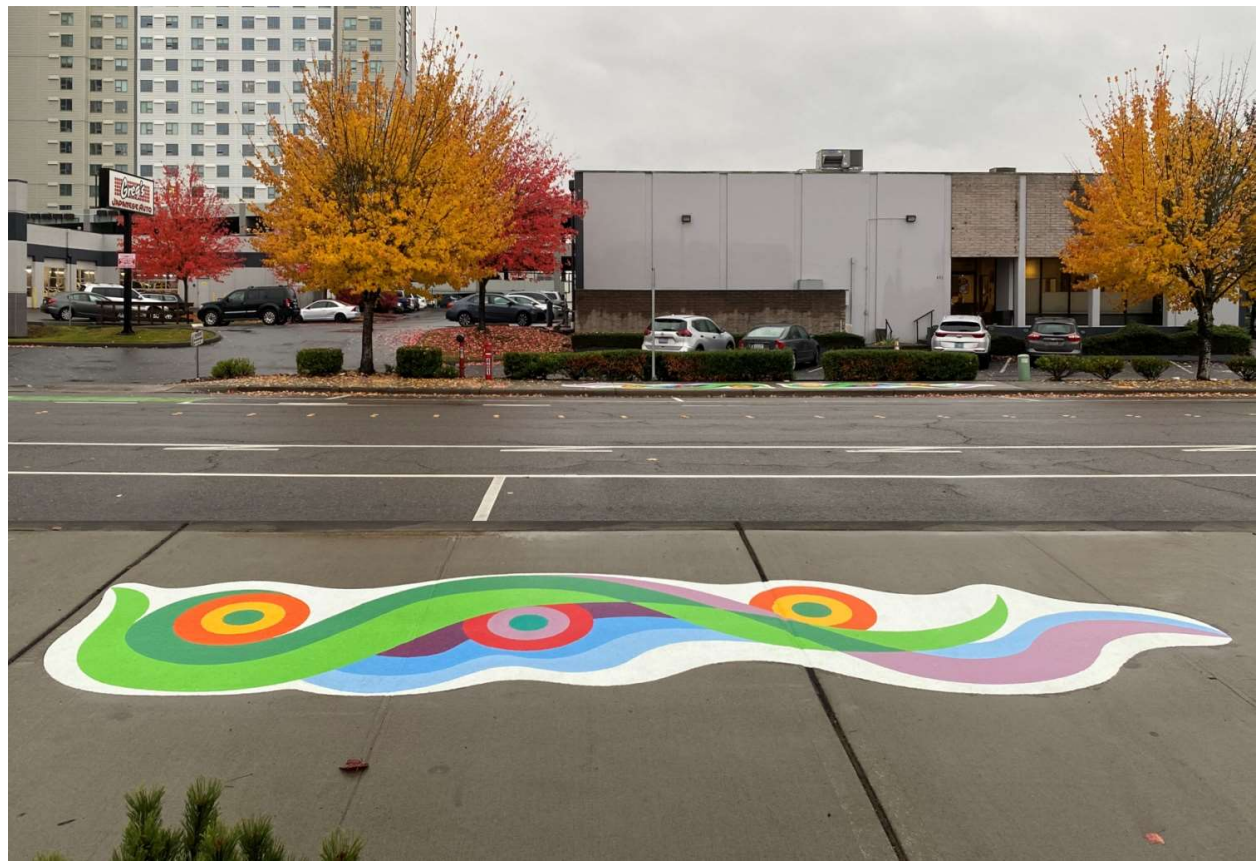
One of the final waves installed along Baker Bvld.

Last year the City of Tukwila Parks and Recreation Department installed artwork along Baker Blvd in the Southcenter District. This artwork was funded largely by the City's tourism funding, with additional funds coming from the City 1% for arts. The artwork is entitled, "Walking the Waves" and is a series of 13 wave designs and 52 dots. This artwork was focused along Baker Blvd between Andover Park West and East.